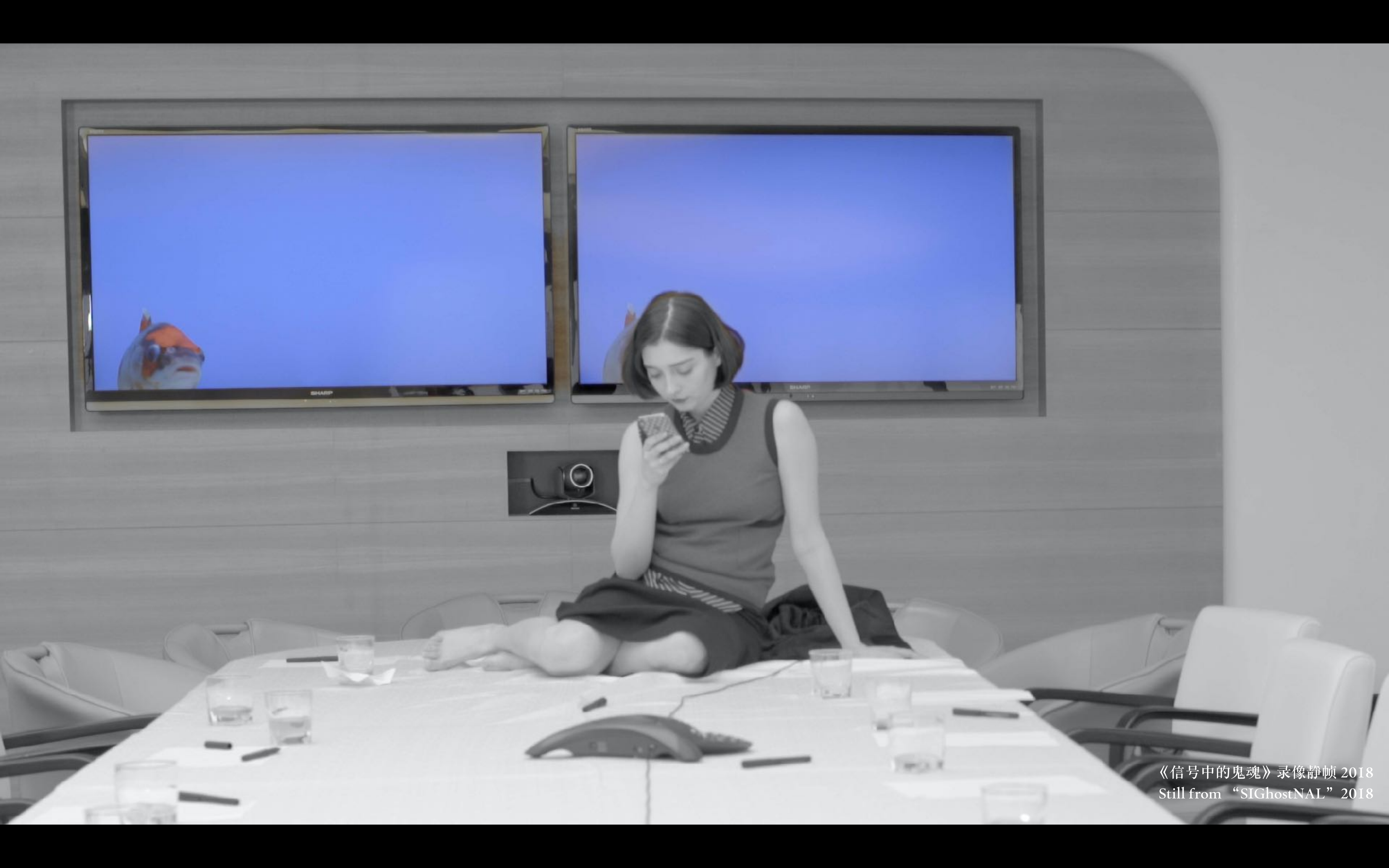
《信号中的鬼魂》录像静帧 2018 Still from "SIGhostNAL" 2018