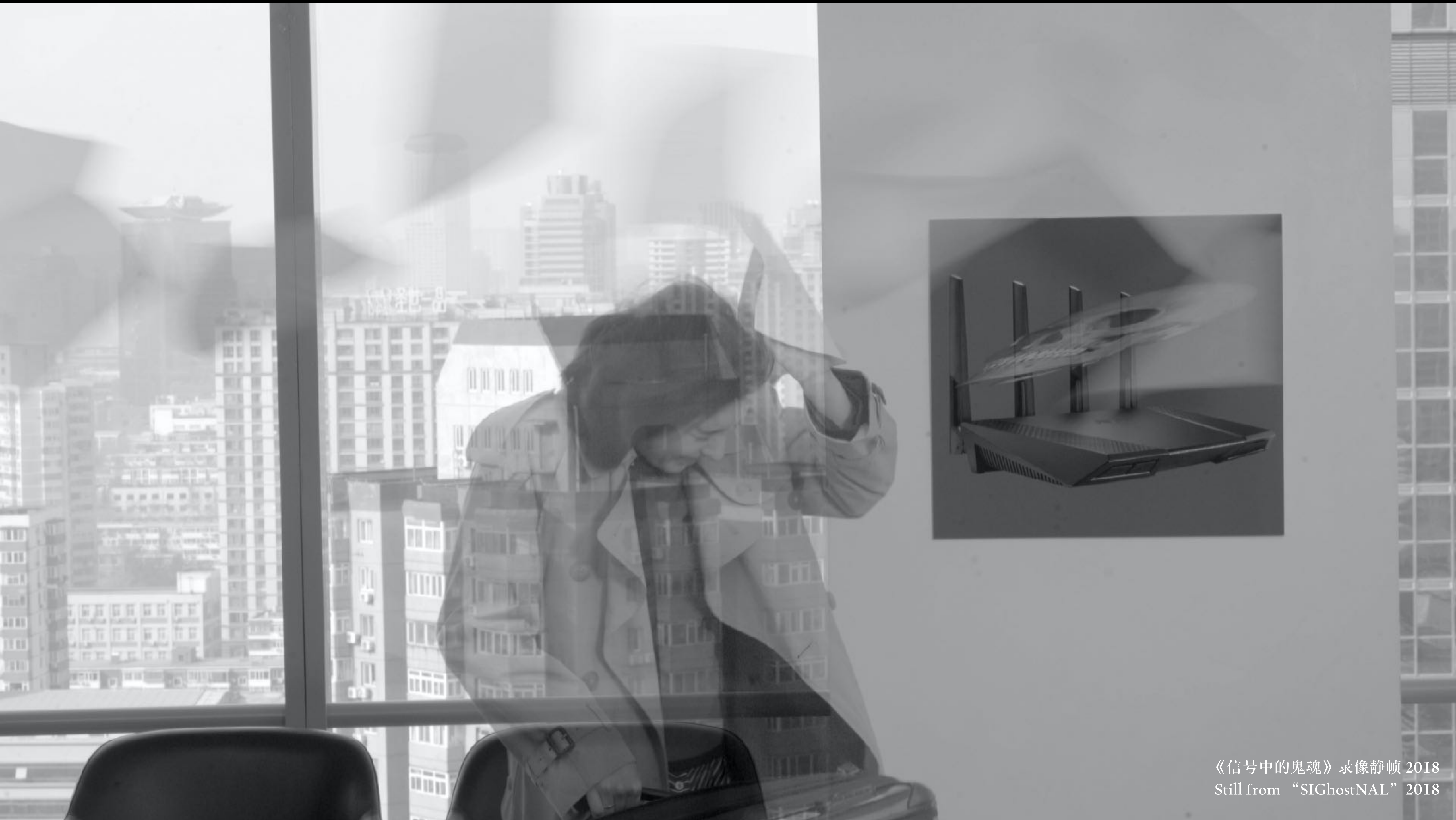
《信号中的鬼魂》录像静帧 2018 Still from "SIGhostNAL" 2018