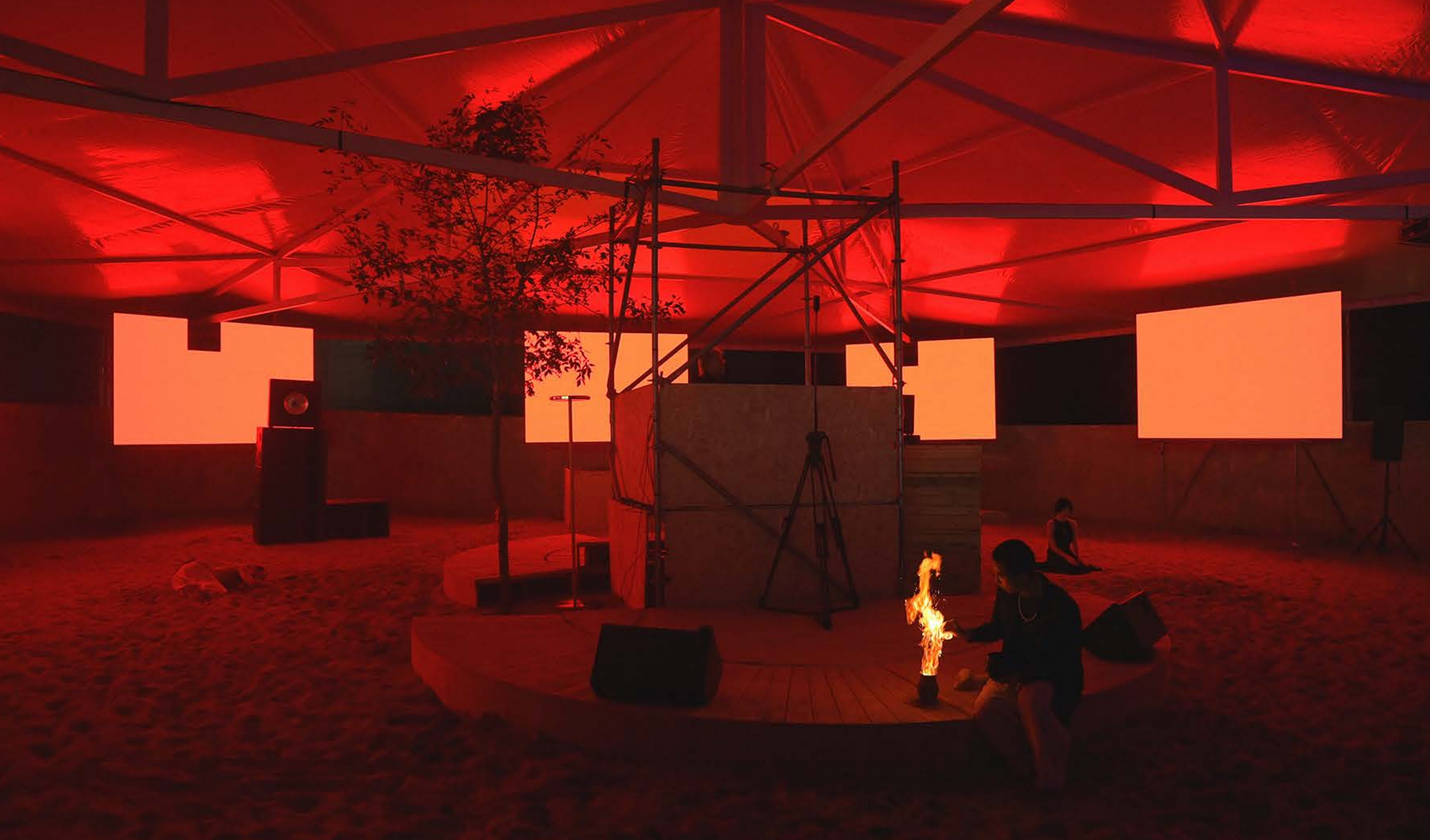
形同虚设II 表演现场, 「阿那亚戏剧节」, 阿那亚, 河北, 中国, 2023 “Form as Emptiness II” performance live, performance at “Aranya Theatre Festival”, Aranya, Hebei, China, 2023