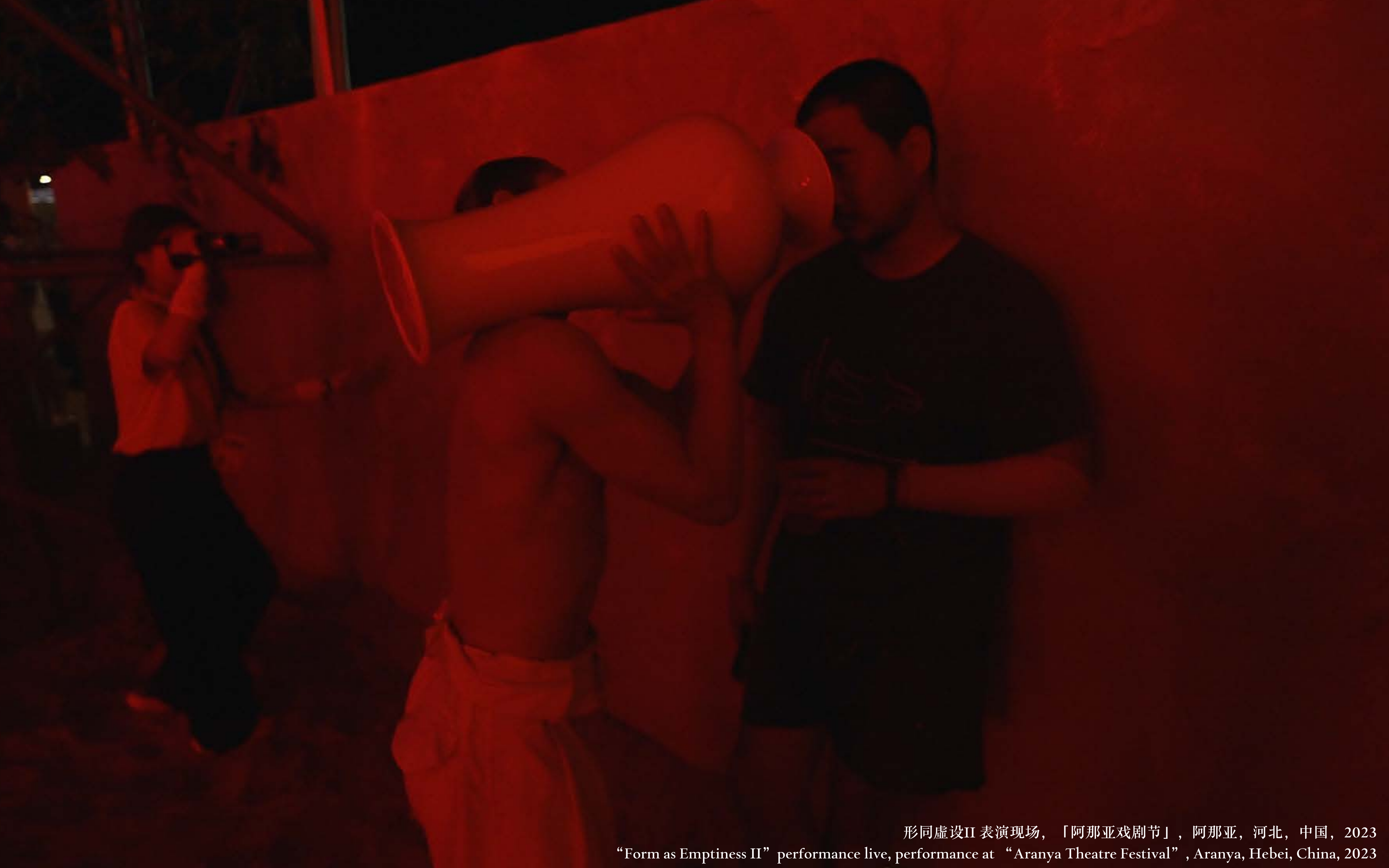
形同虚设II 表演现场, 「阿那亚戏剧节」, 阿那亚, 河北, 中国, 2023 “Form as Emptiness II” performance live, performance at “Aranya Theatre Festival”, Aranya, Hebei, China, 2023