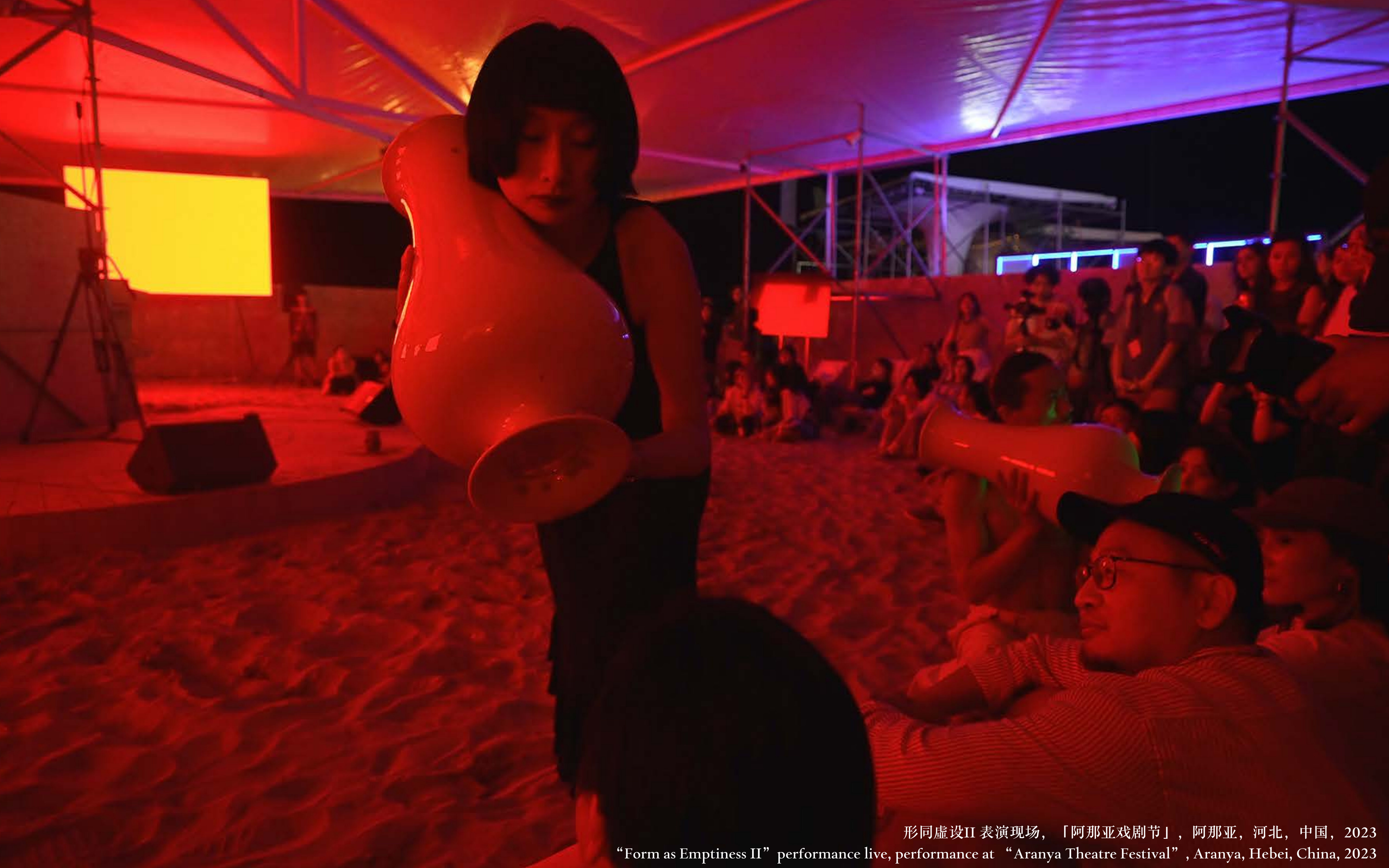
形同虚设II 表演现场, 「阿那亚戏剧节」, 阿那亚, 河北, 中国, 2023